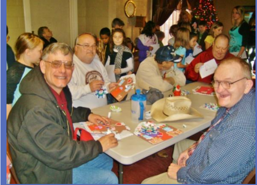
3 rd and 4 th graders visit a residential care home with songs and hand-made gifts!