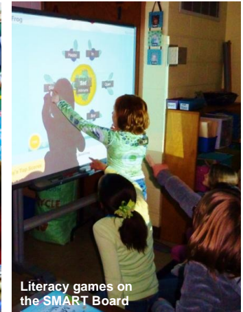
Literacy games on the SMART Board