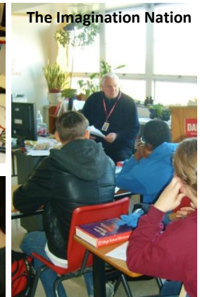
The Imagination Nation