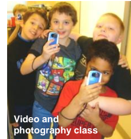
Video and photography class