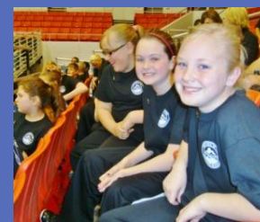
Dewar BRIDGE students perform at the Tulsa 66ers halftime show!